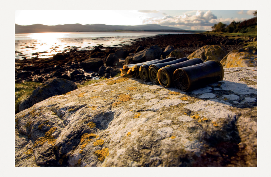
VOYAGER TOTAL MASSAGE JOURNEY (90 mins) £130